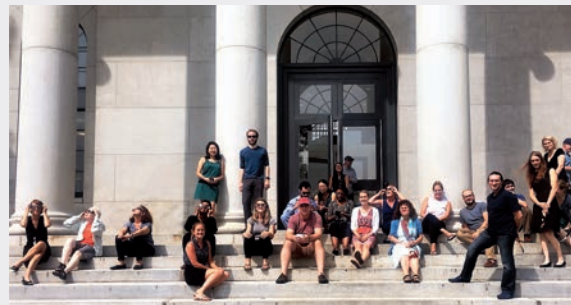
Members of the Department enjoy the solar eclipse on Littauer's steps, August 2017