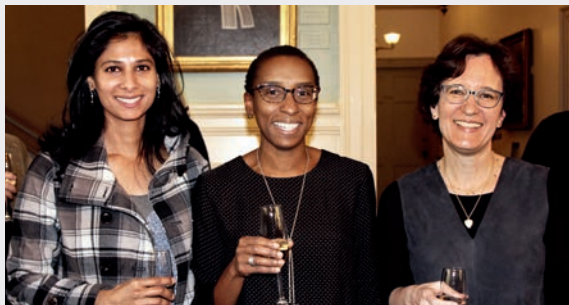
Department and University colleagues toast Oliver Hart's Nobel Prize, October 2016