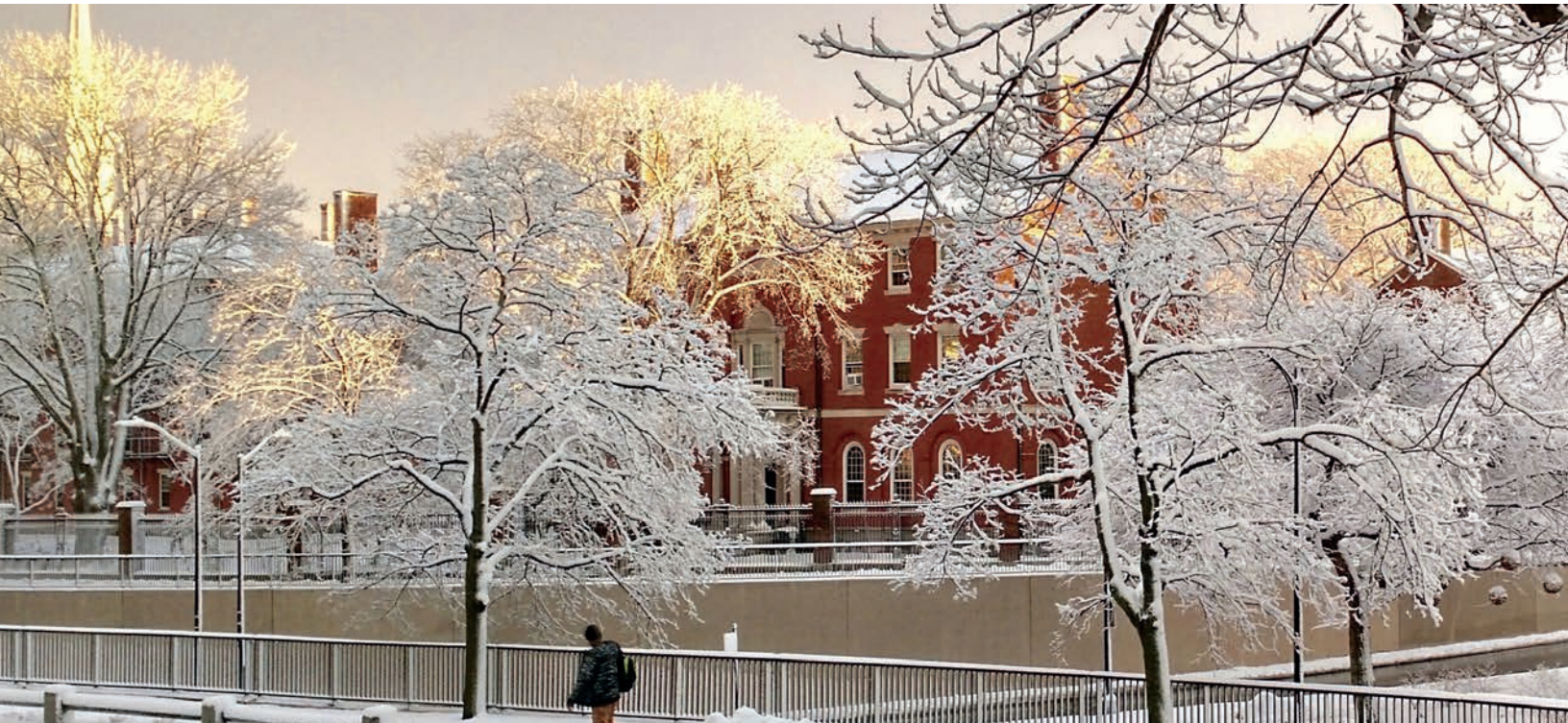
Snowy Sunset, view from Littauer

NON-PROFIT ORG. U.S. POSTAGE PAID Boston, MA Permit No. 1636