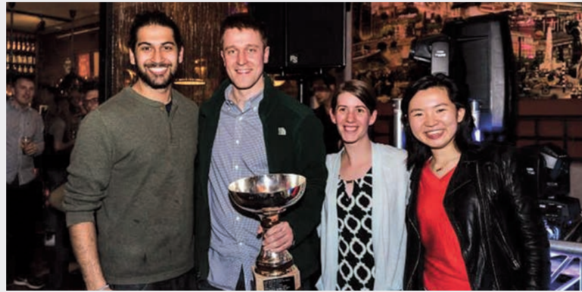
Celebrating Harvard's win at the Econometric Game