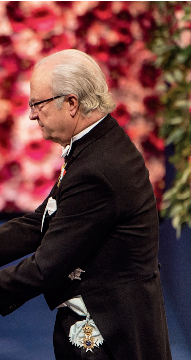
Oliver Hart receiving his Prize from H.M. King Carl XVI Gustaf of Sweden